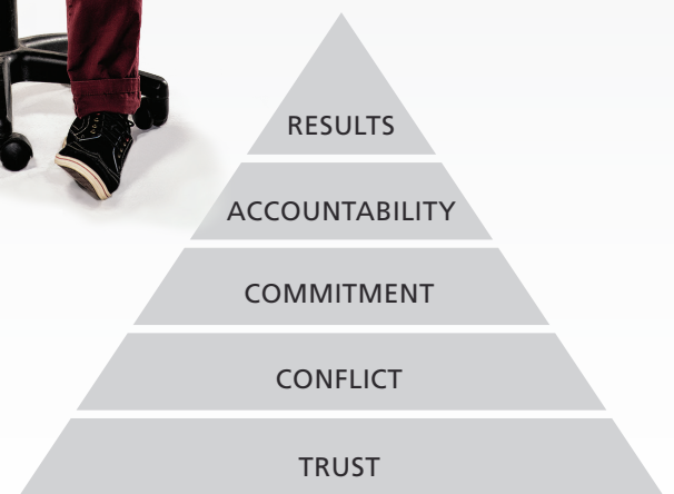
The Five Behaviors of a Cohesive Team Model