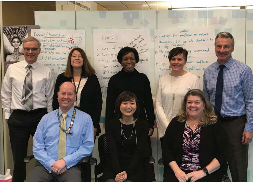
Finance and Business Operations team members.

Practicing Commitment made it easier for them to hold each other accountable. They strived to keep Accountability, the fourth behavior of the model, at the forefront. They understood that they each have a responsibility to the team and to each other to ensure they are all working towards the good of the team.