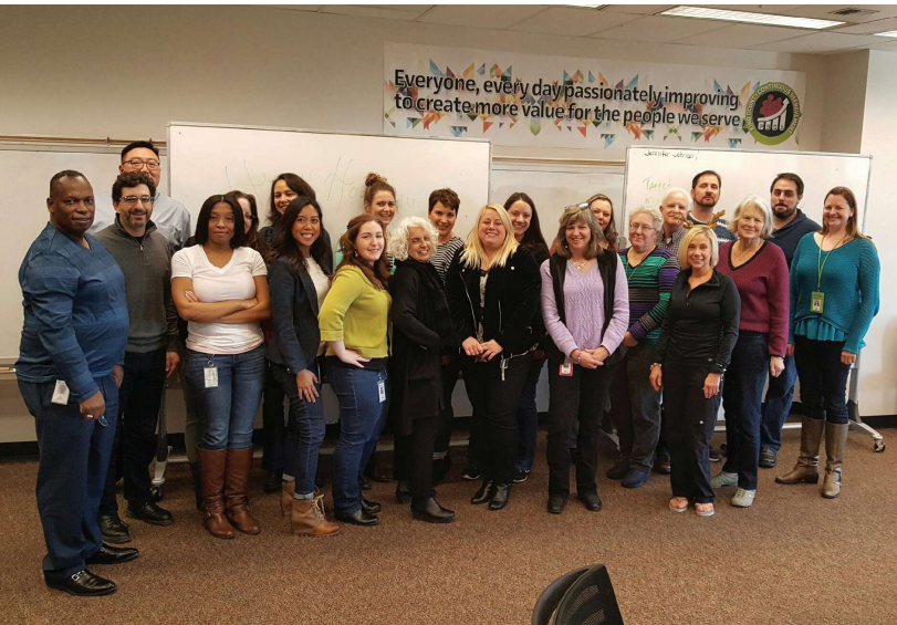
Office of Risk Management Services team members.