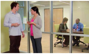
"Would you look at those two?"