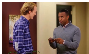
"Catch the game last night?"