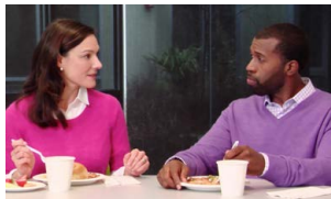
"Just deal with it."