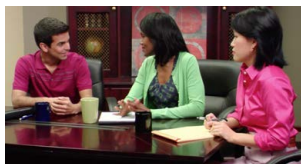
"I've heard he's one of the best."