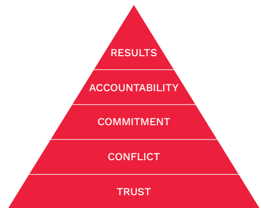
The Five Behaviors Model

The experience is completed through a half-day training session, led by a trained Five Behaviors expert. This session includes a walkthrough of the Personal Development profile, breakout activities, and group discussion.