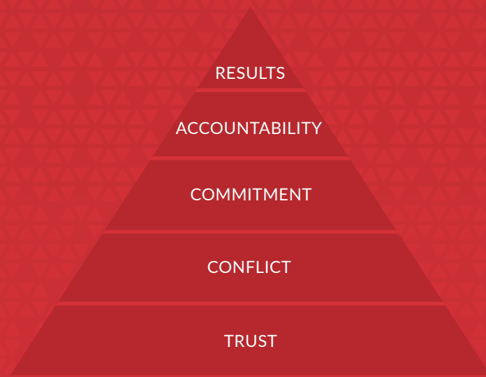
The Five Behaviors of a Cohesive Team™ Model